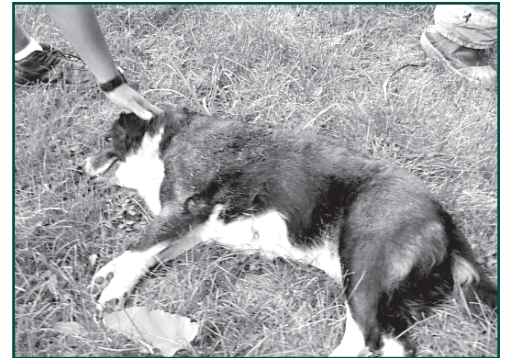
Lady recovers after successful rescue