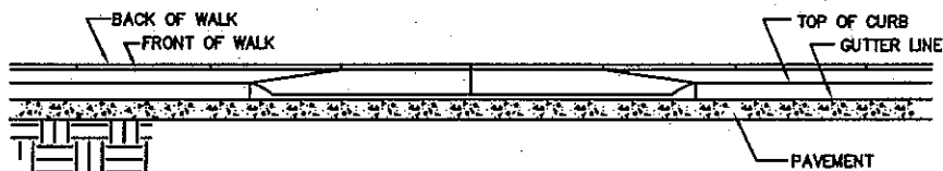
VIEW FROM STREET LEVEL SECTION B-B