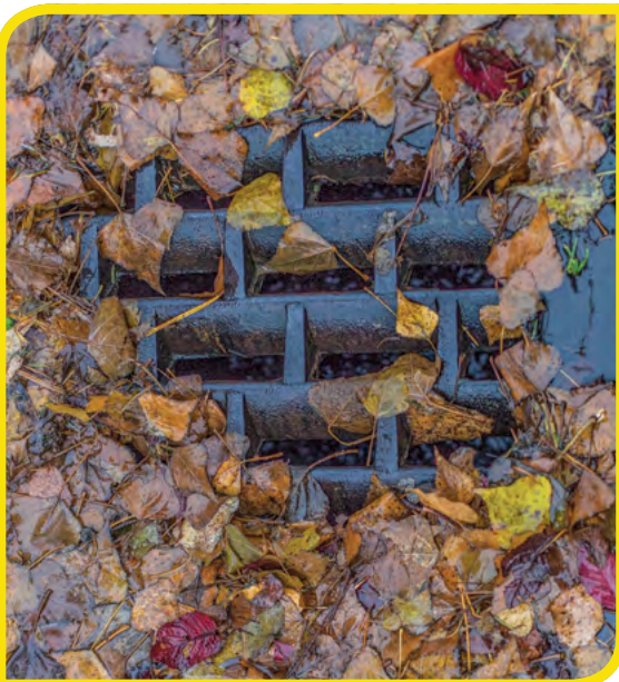
Clear storm drains of fallen leaves and other debris to reduce the chance of localized street flooding.

Fort Wayne's Street Department employees will pick up leaves and will clean leaves off the streets, and City Utilities has a program to clean the city's approximately 19,500 inlets about once every three years. But the City also relies on your efforts as a good neighbor to reduce flooding and protect property in your neighborhood.