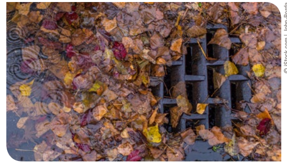
Clear leaves and debris from storm drains to minimize localized flooding during heavy rains.

Sometimes heavy rains can totally overwhelm Fort Wayne's storm sewer system. In autumn, falling leaves can block storm drain inlets causing standing water and localized flooding even during smaller rain storms. You and your neighbors can protect your property and help ensure that emergency and other vehicles have access to your neighborhood by doing the following: