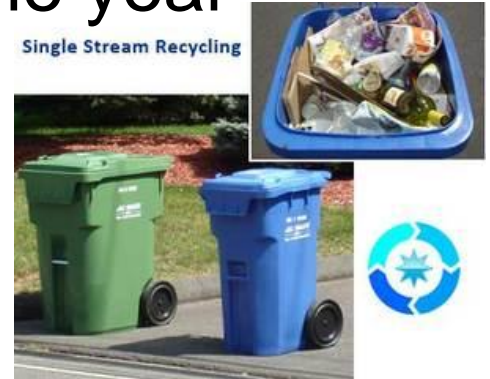
Single Stream Recycling