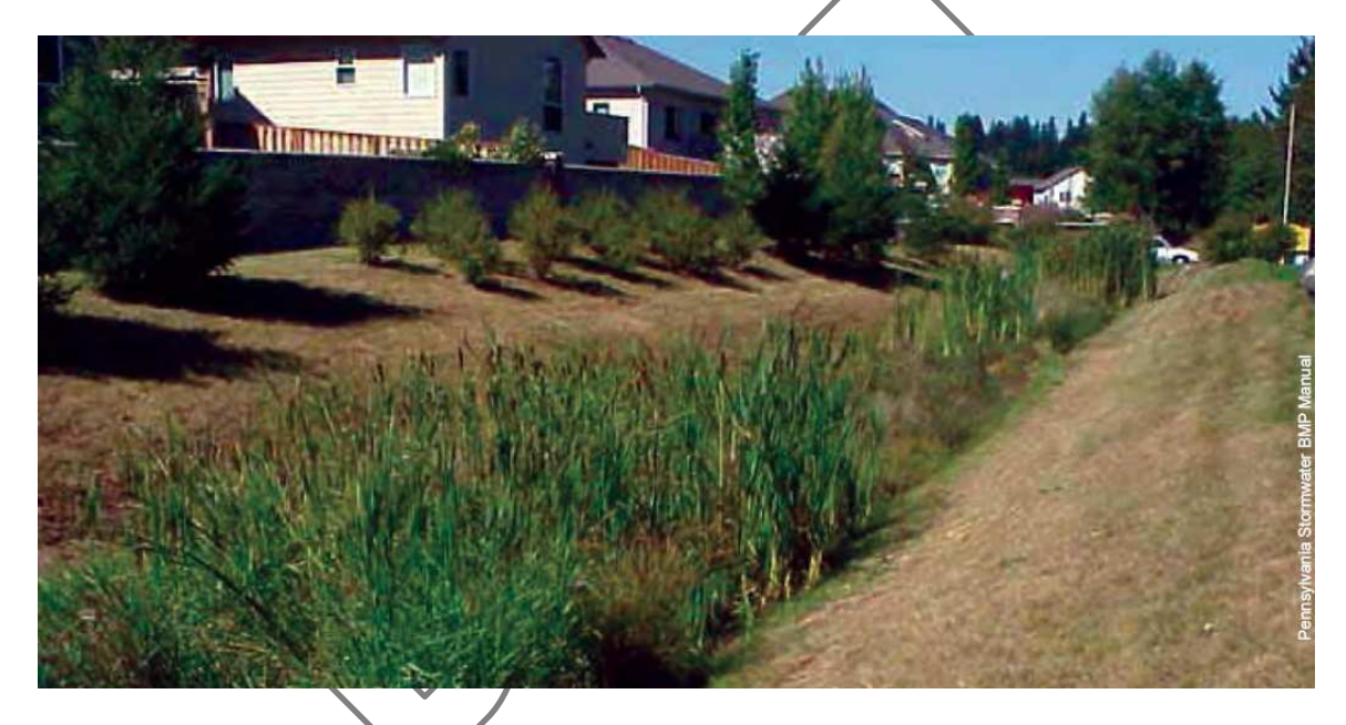
SWALE IN EASEMENT OF SUBDIVISION

Swales are applicable in many urban settings such as parking, commercial and light industrial facilities, roads and highways, and residential developments. For instance, a swale is a practical replacement for roadway median strips and parking lot curb and gutter. Swales can be an effective means of decentralizing storm water management so that primary detention facilities become less necessary.