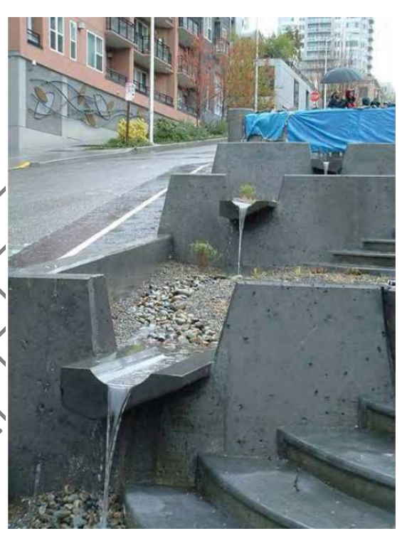
RIVER ROCK SWALE

The channel itself provides the storage volume and conveyance capacity of the swale. Swale design should balance the infiltration and treatment requirements of small storms with needs for conveyance during large storms