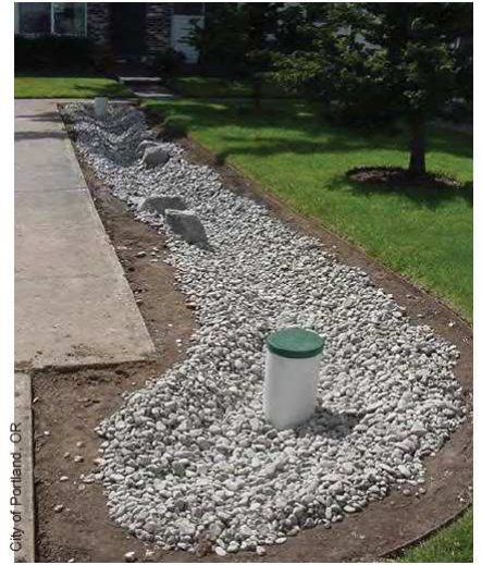
SUBSURFACE INFILTRATION COLLECTING DRAINAGE FROM AN IMPERVIOUS AREA

Subsurface infiltration systems are designed to provide temporary below grade storage infiltration of storm water as it infiltrates into the ground. Dry wells, infiltration trenches and beds are a few examples of these types of systems. Infiltration is a preferred method for storm water management where appropriate site conditions and soils exist. The use of infiltration methods helps to minimize the storm water loading on existing storm sewer systems and can reduce the amount of overflows for combined sewer systems. By infiltrating storm water on-site, downstream impacts resulting from storm water flows are reduced or in some cases eliminated.