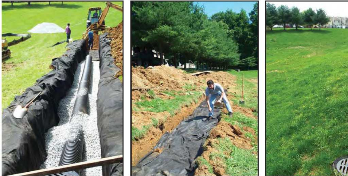
Pennsylvania Stormwater BMP