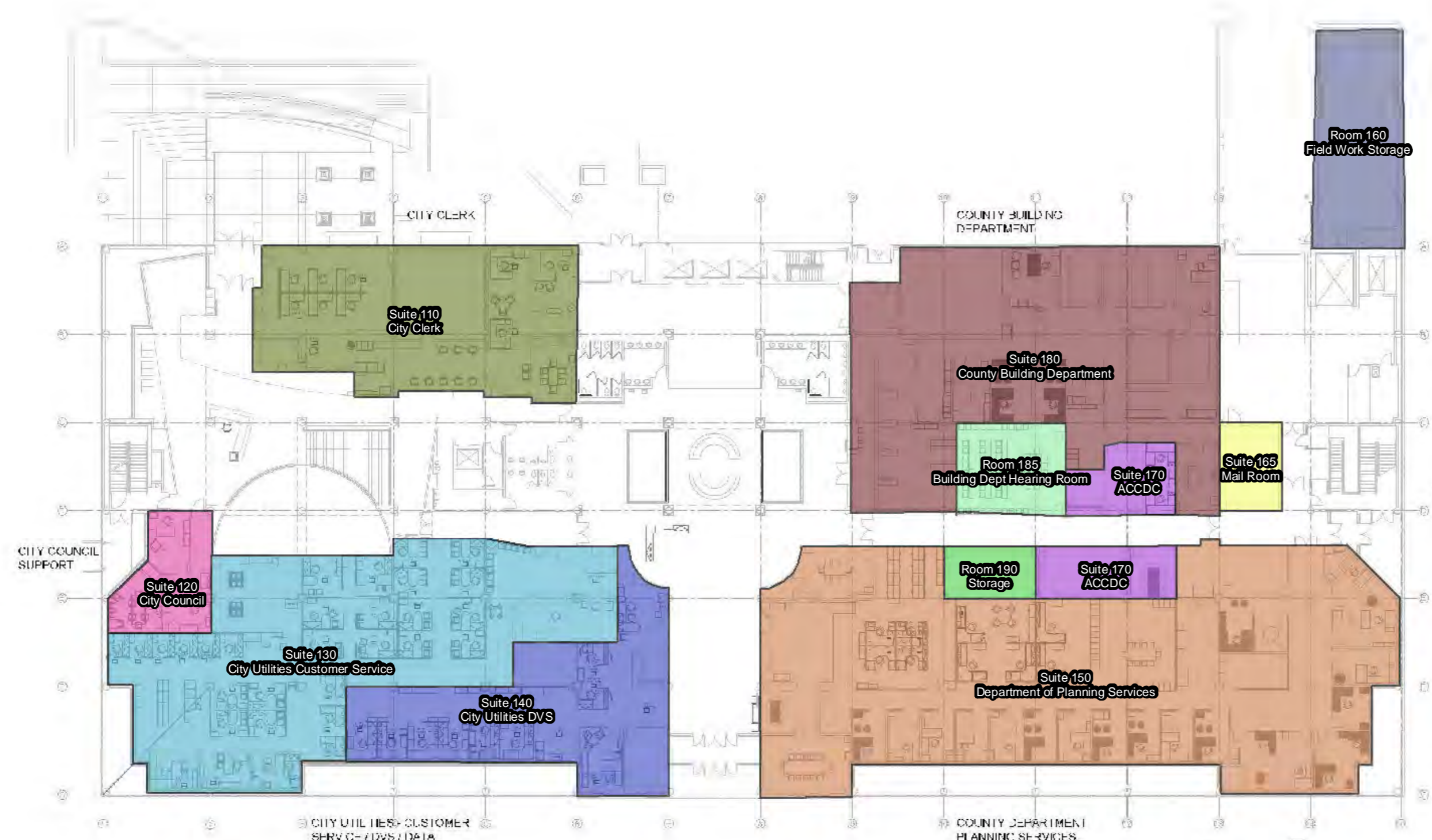
1 FIRST FLOOR IN PROGRESS - 01-18-11 3/32" = 1'-0"

SCHENKELSHULTZ ARCHITECTURE PLLC 111 E Wayne St Fort Wayne, IN 46802 Phone: 317.466.4000 Fax: 317.466.4000 Website: schenkelshultz.com SS Lic No. 1001-405