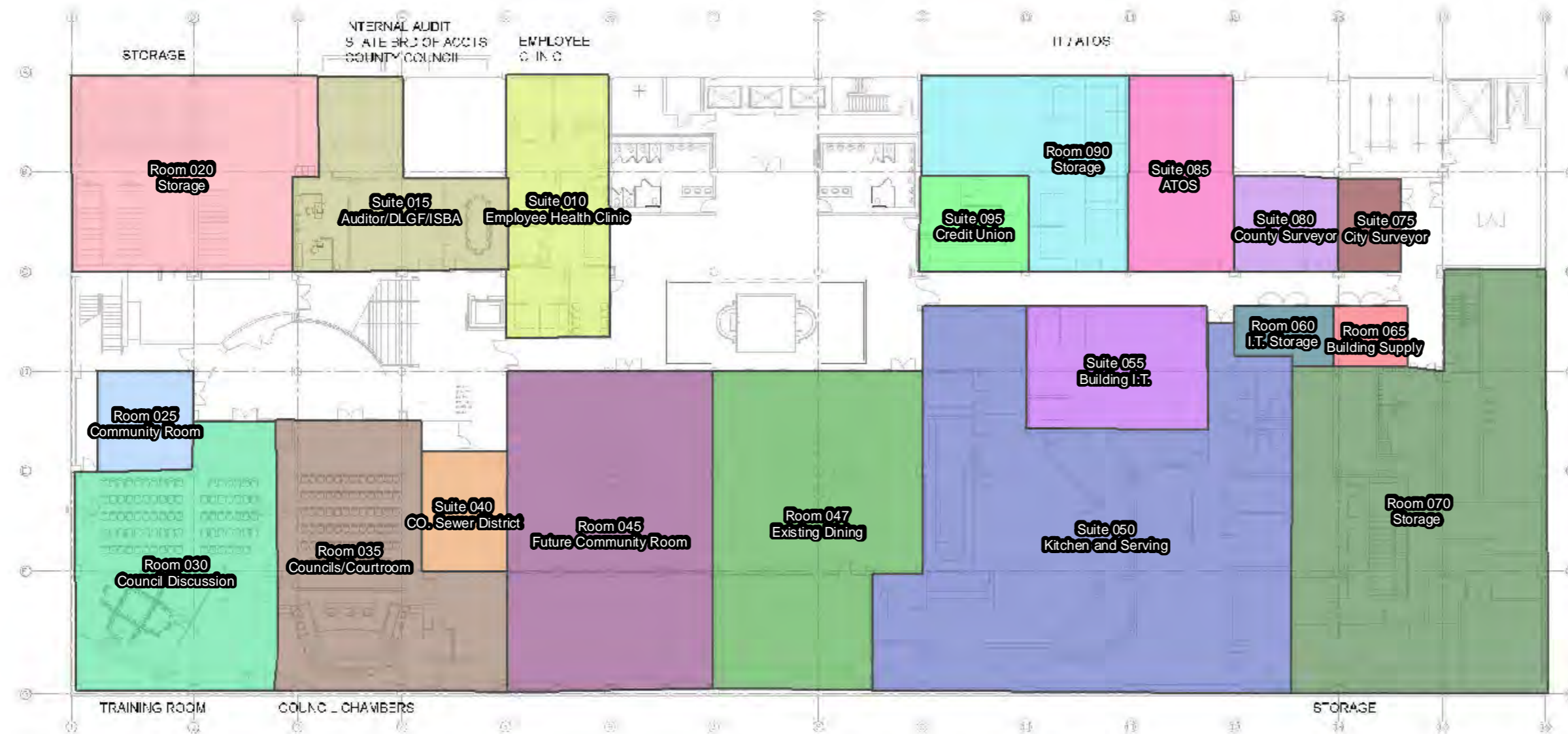
1 GARDEN LEVEL IN PROGRESS - 01-18-11 3/32" = 1'-0"

SCHENKELSHULTZ L L P ARCHITECTURE & INTERIOR DESIGN 111 S. Wayne St. Suite 505 Fort Wayne, IN 46837 Phone: 317-424-9990 Fax: 317-424-1222 schenkelshultz.com SS Lic No. 10001405 B