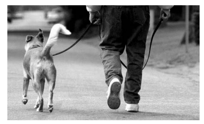
Please be respectful by keeping your dog properly leashed.

People love to have their dogs with them when they play, walk, jog, and picnic. On any given day you'll see an assortment of delighted canines joyfully accompanying an owner on a park outing. Dogs are welcome in the parks, but making certain they are leashed and under control is required.