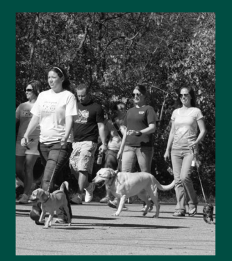
Ready...Set...Go! Walk 2008 gets underway.

Meeting Standards for Animal Sheltering and Control Set Forth by the Humane Society of the United States