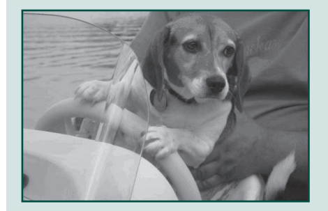
Here is a picture of our Sara that we adopted about a year ago. We are very proud of her and as you can see, she is a very happy camper. She loves to go boating with our family!